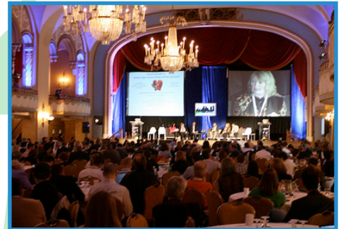
People gather to see a demo at the 2009 Boston Conference